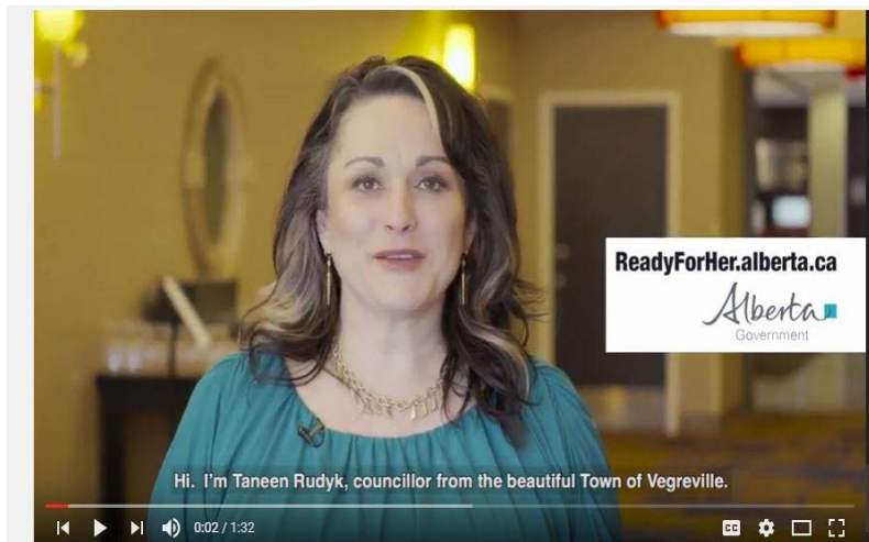
Ready for Her: Multi-tasking political and private life in a small community