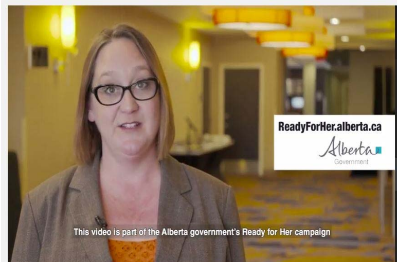
Ready for Her: Raising your profile in your community